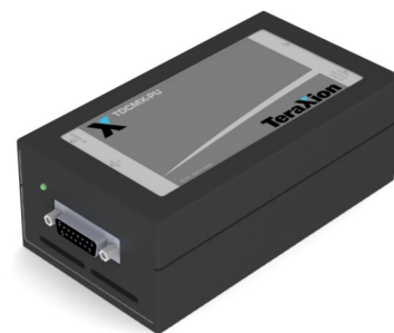
Power and Communication Module